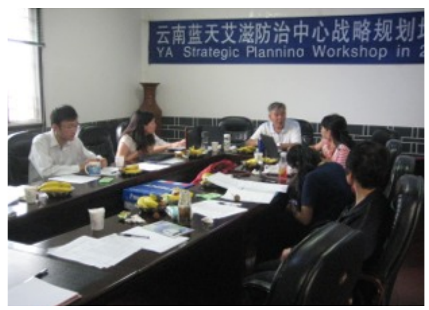
Yunnan AIDS Initiative Strategic Planning in Kunming

As a result of this training, I now know how to create internal systems and an organizational budget.