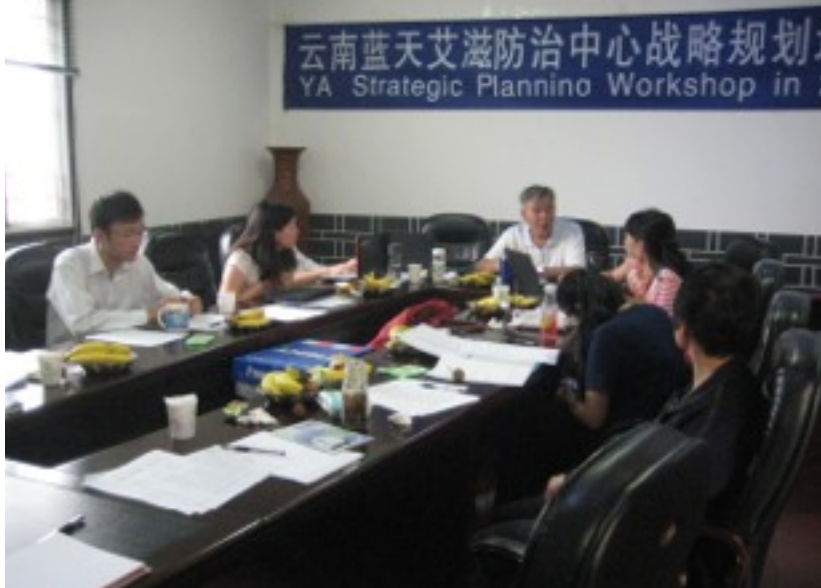
Yunnan AIDS Initiative Strategic Planning in Kunming

As a result of this training, I now know how to create internal systems and an organizational budget.